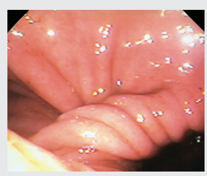
Gastric volvulus, endoscopic view

Paraesophageal hernia repair: This condition occurs when the stomach and sometimes the colon, spleen or pancreas pass through the esophageal hiatus in the diaphragm and lodge in the upper chest. "Paraesophageal hernias usually occur due to age, weight gain or having a defect in the hiatus that gets larger over time," said Rogers. Some patients may be asymptomatic for years. Advanced hernias can involve the entire stomach, which can twist on itself in a condition called volvulus. This is a life-threatening development and requires emergent treatment.